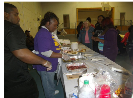
Members of Trinity AME Zion Church from Ensley served a Thanksgiving meal to many of our residential consumers from Hoover, Homewood and other areas.